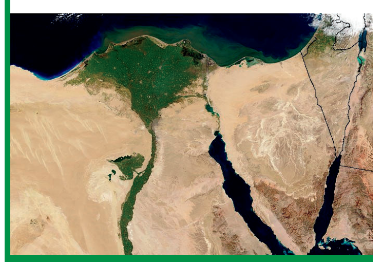
Nile Delta from space. Note the green irrigated land along the river in contrast to the desert.

The Egyptian calendar was based on the flooding cycles of the Nile. Hapi, god of the annual floods, was thought to control the flooding along with the pharaoh. The Nile was even considered the causeway from life to death and the afterlife. All tombs were situated west of the Nile (where the sun sets, symbolising death) as opposed to the east (where the sun rises, symbolising birth and growth).