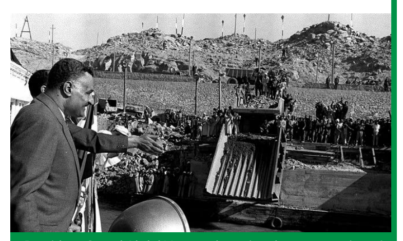
President Gamal Abdel Nasser observing the construction of the Aswan Dam (1963).

The Nile's potential for harnessing hydropower was studied in the 1950s and the first dam, the Aswan Dam, was completed in 1970. The ability to better control flooding, provide increased water storage for irrigation and generate hydroelectricity helped drive Egypt's industrialisation. Damming of the Nile at various points has inevitably led to water sharing disputes between countries along the Nile.