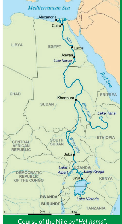
Course of the Nile by "Hel-hama", Wikimedia Commons

Egypt's status as a world power declined at the hands of Assyria, Babylon, and Greece. The Romans relegated Egypt to a province but valued it for its grain production that fed an Empire. The Nile nonetheless remained an important factor in Egyptian life.